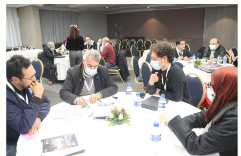
Session 2 - Team work