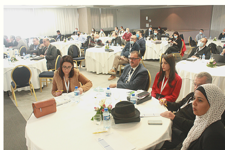
REMO team from ENSTAB