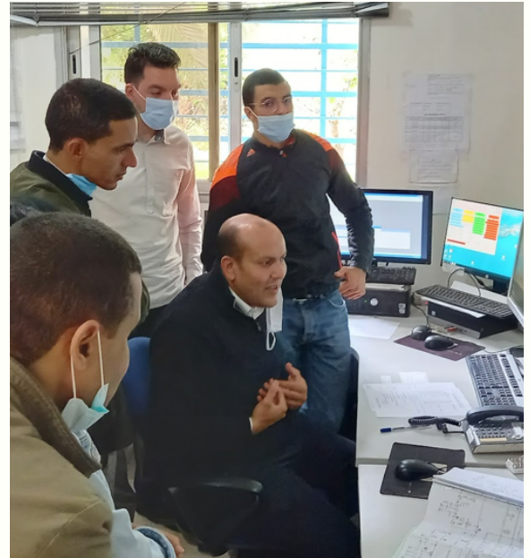
AUI team inside the Monitoring & Control unit during the visit at the regional dispatching center.

The visit was very instructive and fruitful as it opened the door to future collaboration between the REMO team in Morocco and ONEE in the field of e-mobility and its impact on the regional grid.